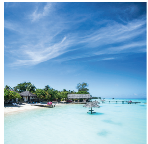
Your hotel "Havaiki Lodge" on Fakarava is in paradise.

*Prices start at $3,850.00. Rates are based on a shared double cabins onboard the catamaran and a shared double beach bungalow on land. Inter-island flights are included in price. International flights are not included.